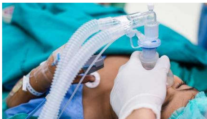
Figure1: Anesthesia and Intensive Care Medicine